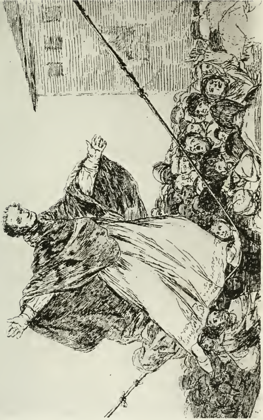
OVER THE JAWS OF THE CROWD